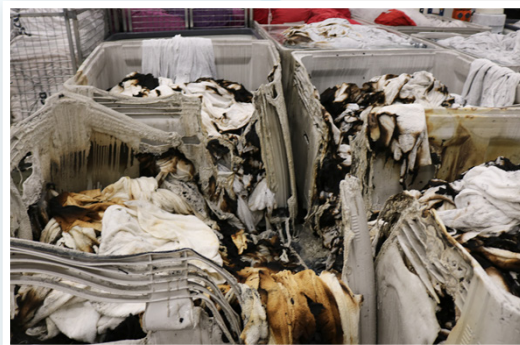
Bins of towels where the fire occurred, and was contained by the sprinklers.

The fire started from the spontaneous combustion of the towels which had been exposed to massage oils, a phenomenon that is well known in our industry and is unfortunately becoming a more common cause of fires.