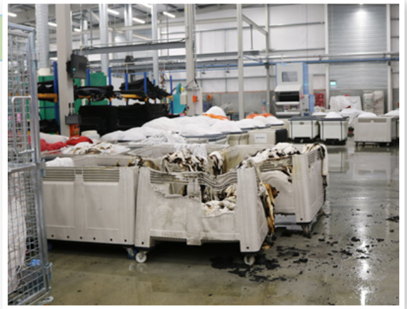
Damp towels and a wet floor in the concentrated areas where the fire occurred

The fire started in mobile bins containing towels in an open area. Heat from the fire set-off three sprinkler heads directly above the area, which meant the electricity and other assets in the building were left undamaged.